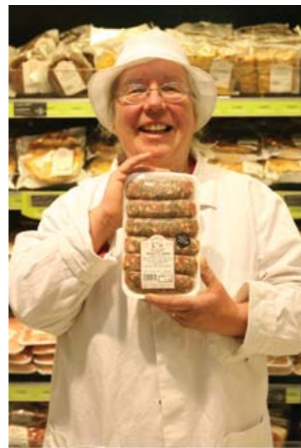
Best-selling bangers: one of many locally-sourced products in store

We now stock over 500 local products from across the three counties of Gloucestershire, Warwickshire and Worcestershire.