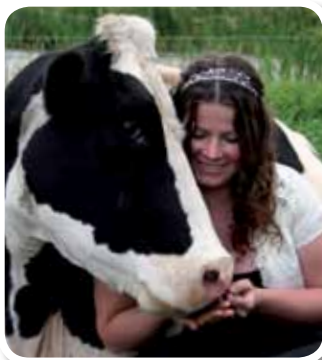
Jess' Ladies Organic Milk