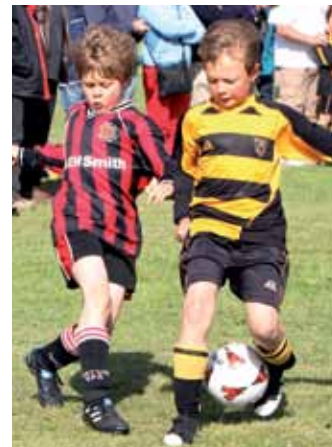
Proud to sponsor the first Bidford Juniors Football Tournament