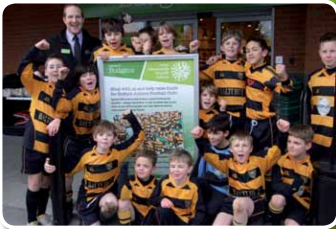
Raising money for Bidford Juniors FC