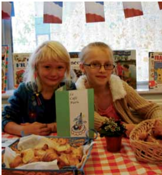
Supporting Bidford Primary School with a French Café as part of their Cookery Club

As a locally-owned supermarket, we believe in supporting the community in which we trade and are proud to have been involved with the following initiatives. For more details log onto warnersbudgens.co.uk