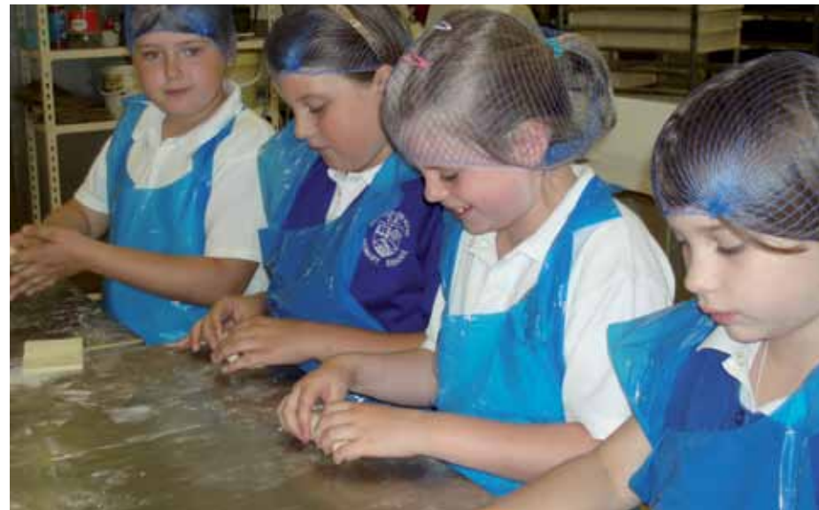
Children from Bidford Primary School visit our local bakery as part of the Warner's Budgens bread project