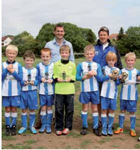
Sponsors of Broadway United FC Juniors end of season awards

As a locally-owned supermarket, we believe in supporting the community in which we trade and are proud to have been involved with the following initiatives. For more details log onto warnersbudgens.co.uk