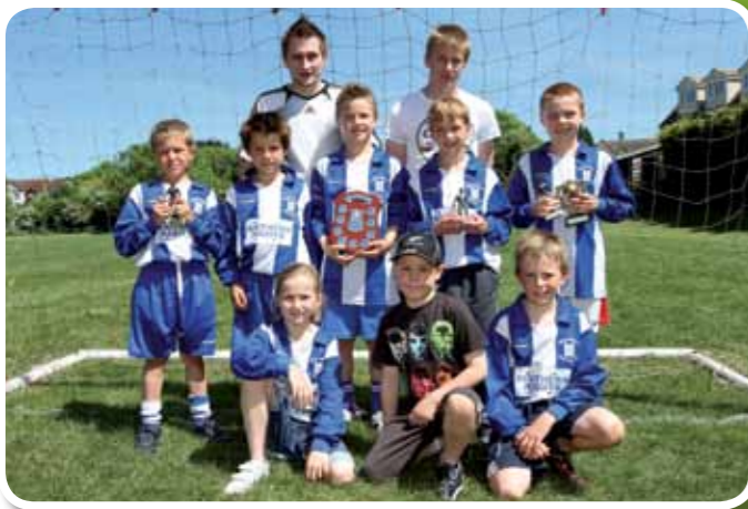
Raising money for Broadway United Youth FC