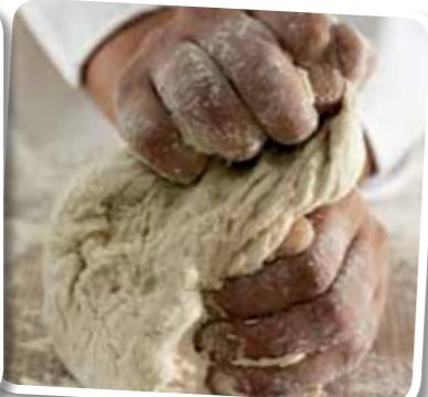
The Bread Company