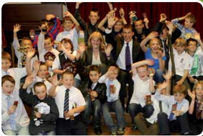
Raising money for Moreton Rangers FC