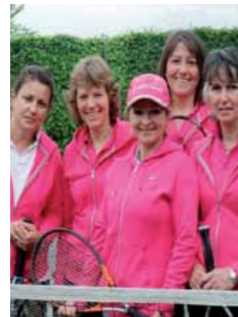
Pleased to support the Cotswold Chicks with their Breast Cancer Awareness Moonwalk