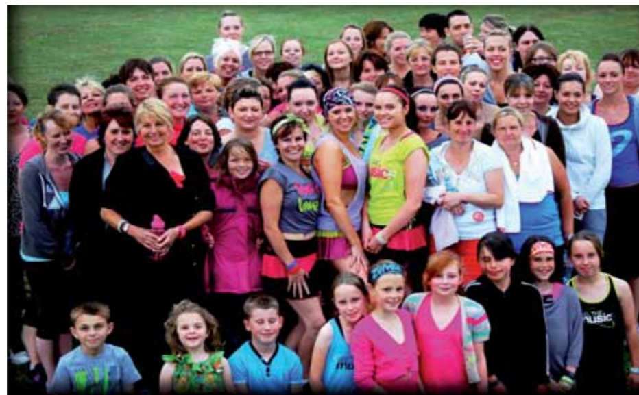
Supporting the local community during the recent Zumbathon in aid of the Warwickshire Air Ambulance which raised over £1400!