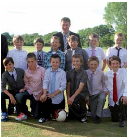
Sponsors of Moreton Rangers FC Juniors end of season awards

As a locally-owned supermarket, we believe in supporting the community in which we trade and are proud to have been involved with the following initiatives. For more details log onto warnersbudgens.co.uk