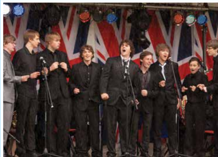
Singing in the rain: the weather couldn't dampen our spirits at the Broadway Village Jubilee Party!