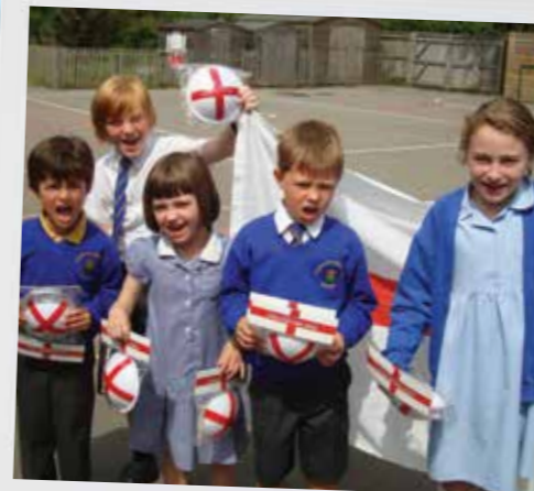
Pupils at St Mary's School show their support for England in Euro 2012