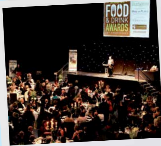
Warner's Budgens sponsored the 2012 Cotswold Life Food & Drink Awards