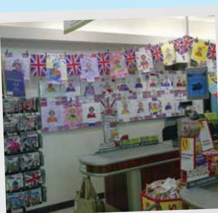
Flying the flag: entries to our Jubilee poster competition were displayed in our store