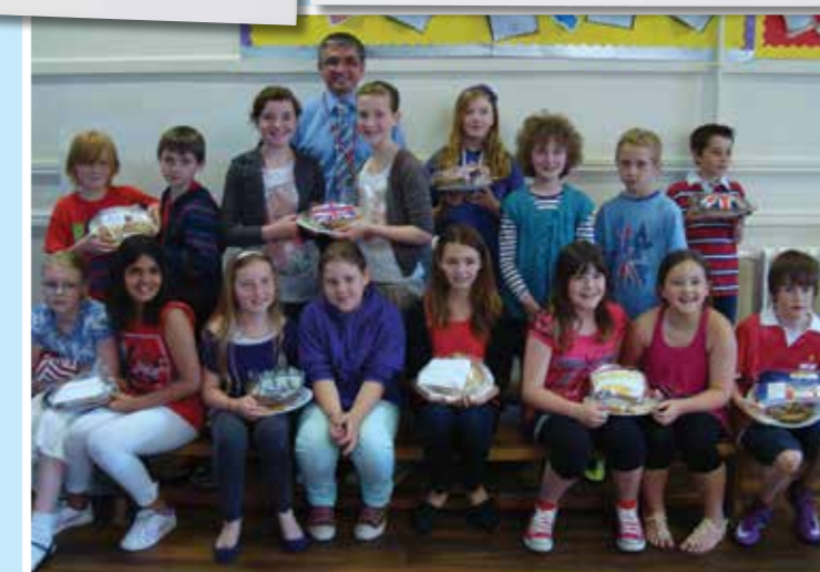
Pupils from St Mary's School show off their baking skills during the Warner's Budgens Bread Project