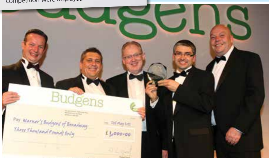
Staff from Warner's Budgens Broadway collecting their Budgens Store of the Year Award