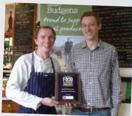
Our Seasonal Lunch partner, The Horse and Groom, won best pub restaurant at the Cotswold Life Food & Drink Awards