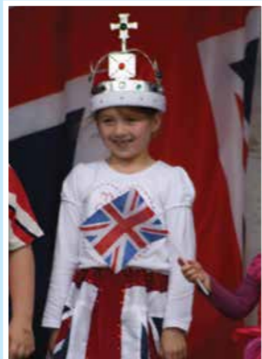
Having fun at the Broadway Village Jubilee Party