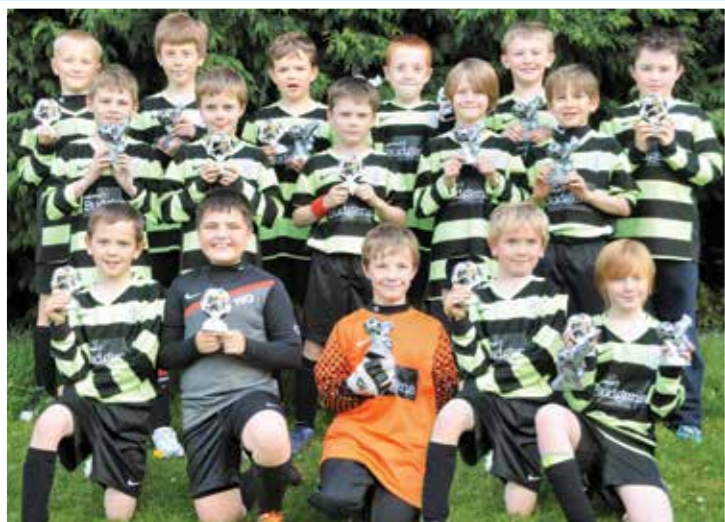
Broadway United Under 9s: Ambassador Evesham Football League Plate winners and league runners-up