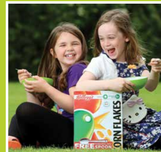
A recent initiative with Kellogg's meant we could donate lots of cereal to local schools breakfast clubs