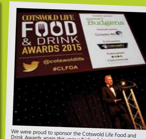
We were proud to sponsor the Cotswold Life Food and Drink Awards again this year which celebrates the very best of local produce