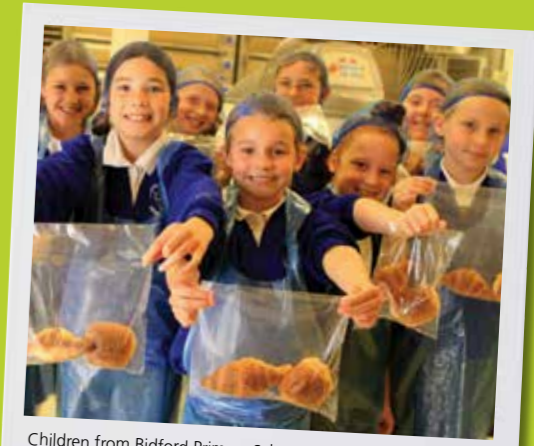
Children from Bidford Primary School visit our local bakery, La Parisienne, to make croissants