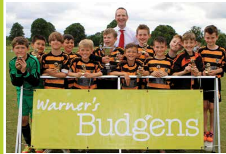
Bidford Juniors, proud winners of the Bidford Juniors Football Tournament, sponsored again this year, by Warner's Budgens