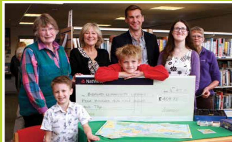
Another cheque from our Community Savings Scheme for Bidford Community Library