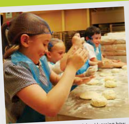
The children from Bidford Primary School learning how to make bread at our bakery as part of our week-long bread project.