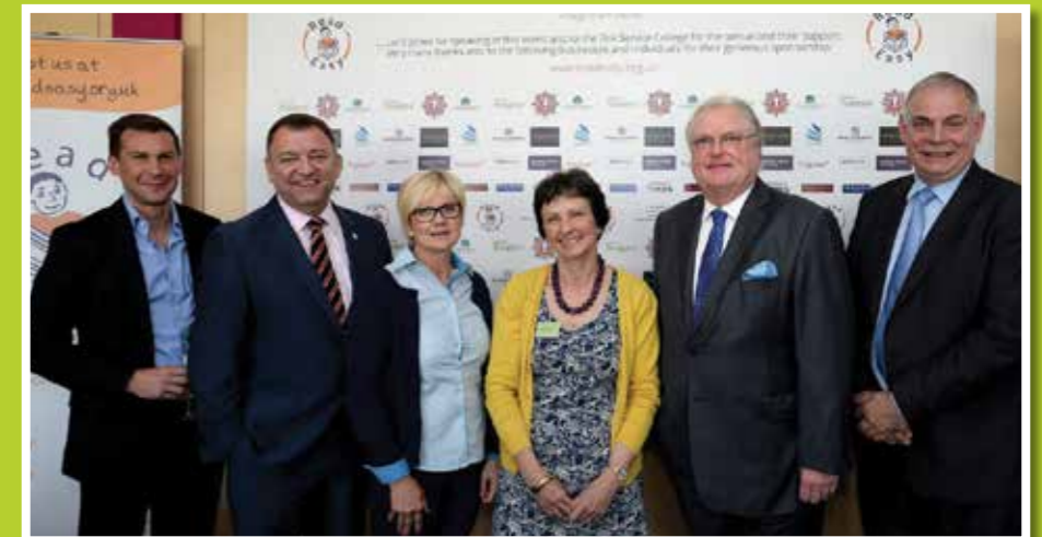
Local charity, Read Easy UK received a visit from one of our famous local residents Lord Digby Jones recently when he hosted a fund-raising lunch for the charity, which Warner's Budgens were pleased to sponsor.