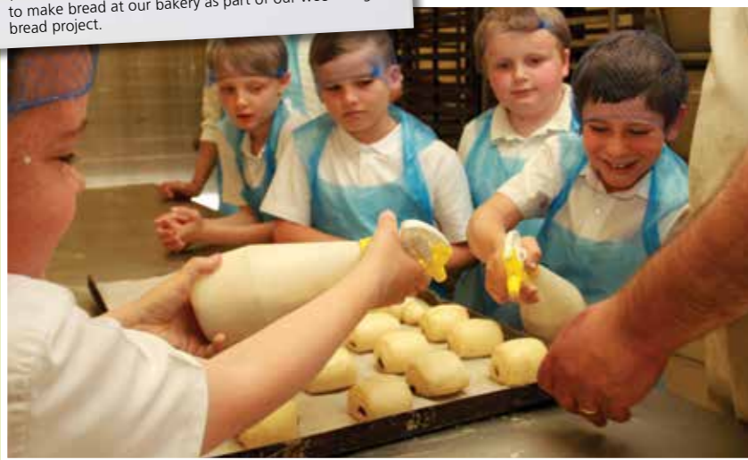
Bidford Primary School took part in our week-long project all about bread and had a great trip to our bakery where they learnt how to make croissants and pain au chocolat – they even got to take some home!