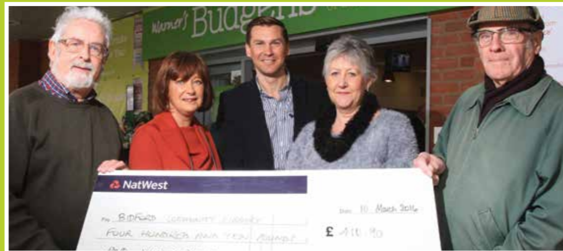
Bidford Community Library continues to benefit from our Community Savings Scheme. Some of the directors and volunteers were pleased to receive the most recent cheque.