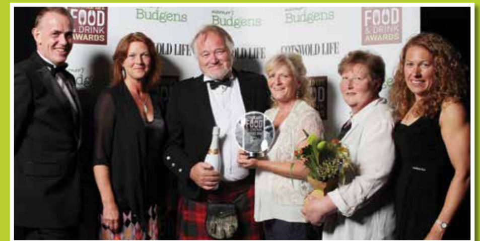
We were delighted that one of our local producers, Godsell's Cheese from Leonard Stanley, won the Cheese of the Year Award at the Cotswold Life Food and Drink Awards which we were pleased to sponsor again for the ninth consecutive year.