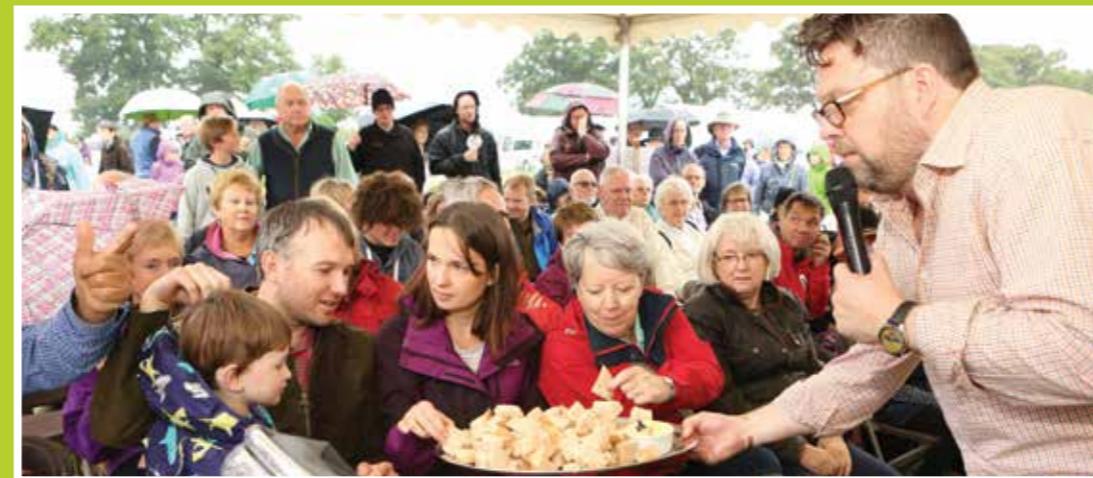
Once again, we were very proud to sponsor the local food tents at the Moreton Show and host our very own food demonstration area. We welcomed several local chefs and producers who, despite the rain, had a great audience to watch them.