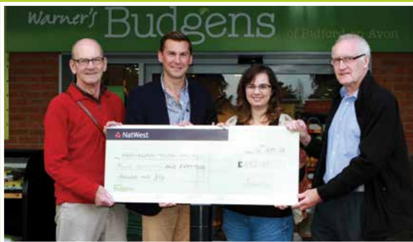
One of the charities that we supported through our Community Savings Scheme was Harvington Youth Project who used the money to buy furniture for their drop-in café for local children.